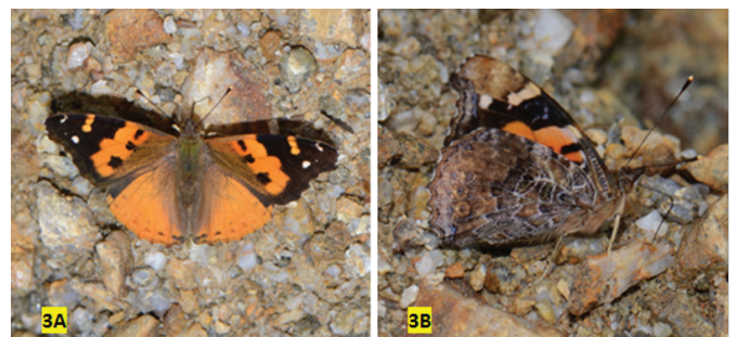
Figure 3. The male V. samani found on 25 June 2016 in Kedah Village, Gayo Highlands, Aceh Province, Indonesia: A. Upperside, and; B. Underside.