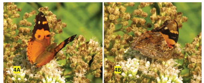
Figure 4. The male V. samani perched on the flower of Austroepatorium inulifolium on 18 August 2018, Talang Pisang Village, Jambul Highlands, South Sumatra Province, Indonesia: A. Upperside, and; B. Underside (Photo: Pormansyah).