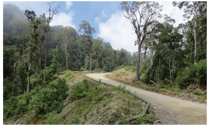
Figure 2. Habitat of V. samani in Talang Pisang Village, Jambul Highlands, South Sumatra Province, Indonesia (Photo: Guntur Pragustiandi).

above sea level. Whitten et al (2000) defined these altitude zones (1.200 to 2.100 m) as lower montane forest of Sumatra. Unfortunately, the specimens were not collected due to a lack of preservation materials and permit restrictions during field work visitations. However, through the use of a series of photographic images, these butterflies were identified at species level based on a combination of specific morphological characteristics (Figure 3 & Figure 4). In both cases, the photographic observations were time stamped and geotagged.