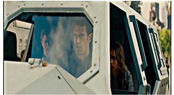
(17:35-21:25) Picture 9. Trying to escape through the great wall

Tris and his friends tried to escape trying to get out of the wall at night (Pg93/Ch11). Tris and friends try to escape trying to get out of the walls of Chicago during the day in the movie.