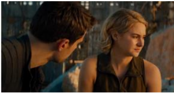
(11:44-11:59) Picture 7. Four and Tris