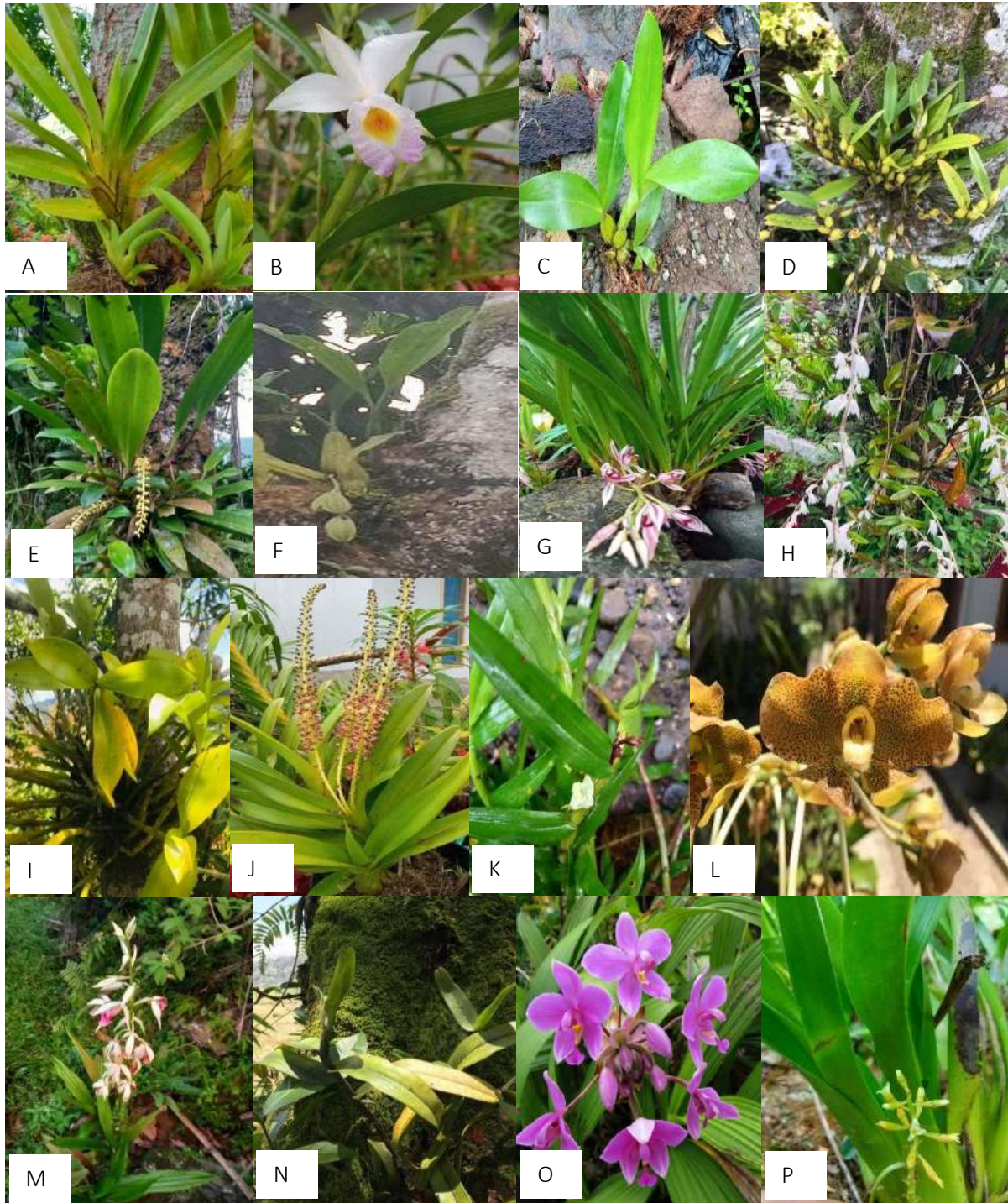
Figure 2. (A) Agrostophyllum lampongense Blume., (B) Arundina graminifolia Hochr., (C) Bulbophyllum sp., (D) Bulbophyllum angustifolium Lindl., (E) Bulbophyllum plavescens Blume., (F) Coelogyne rochussenii De Vriese., (G) Cymbidium dayanum Rchb.f., (H) Dendrobium crumenatum Swartz., (I) Eria sp., (J) Eria iridifolia Hook.F., (K) Eria pilifera Ridley., (L) Grammathophyllum speciosum Blume., (M) Phaius tankervilleae Blume., (N) Robiquatia spatulata Blume., (O) Spathoglottis plicata Roxb., (P) Thelasis carinata Blume.