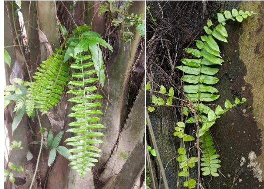
Figure 5. Nephrolepis biserrata Morphology

other large and shady trees. These ferns can also be found around river banks and can also be found in cliff crevices (Aini et al. , 2022; Kambombu & Ina, 2023; Razoki et al. , 2023).