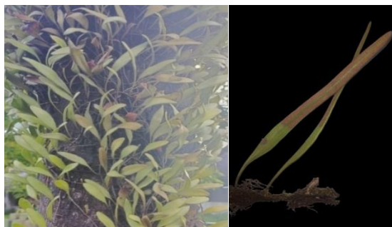
Figure 7. Pyrrosia lanceolata Morphology

in shape. Single leaf type, sitting alternate leaves, flat leaf edges, pinnate leaf veins, sterile leaves lanceolate, upper and lower surfaces of leaves have trichomes, tip and base of leaves tapered. The fertile leaves are lanceolate, the tip of the sterile leaf is blunt, the base of the fertile leaf is tapered, the upper and lower surfaces of the fertile leaf have trichomes. The sorus is located at the tip of the leaf to \frac{3}{4} of the base of the leaf, the sorus is densely distributed under the leaf, is round in shape, dark brown in color, does not have an indusium (Wulandari et al. , 2016; Hartini, 2020; Sartinah et al. , 2023).