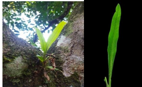
Figure 9. Microsorium punctatum Morphology

Based on research, this epiphytic fern has roots that resemble fibrous roots. These roots are blackish brown in color. The stem resembles a small rhizome, short, covered with dark brown scales, the scales are elongated, similar to a triangle. The stem is round and black, resembling the spikes of a swallow's nest. The single leaf is lanceolate in shape, the color is green, the petiole is not clear, the veins are clear, the tip is pointed, the base of the leaf is winged, and the leaf spines are lobed. It is located in a cluster. Microsorium punctatum has health benefits such as a laxative, diuretic and wound healer. In the field of gardening, cultivars of this plant with branching leaves are usually used to decorate rooms or gardens (Ulum & Setyati, 2015; Sofiyanti & Harahap, 2019; Ruma et al. , 2022)