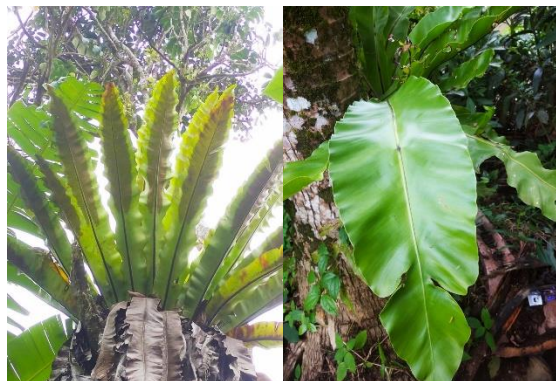
Figure 4. Asplenium nidus L. Morphology

Based on research, this epiphytic fern has a densely arranged fibrous root system that is dark brown in color. The stem is a short black rhizome, covered with fine hairs. Very short stalks, approximately 0.5 - 1 cm, black. The leaves include single leaves, light green to shiny dark green. The surface of the leaves is smooth, the texture resembles paper. The leaves are lanceolate in shape with tapered bases and tips with wavy edges. There are brownish black leaf veins. The leaves are arranged like a rosette. The sorus is located under the surface of the leaf, brown in color and arranged lengthwise from the middle of the leaf vein towards the edge. Asplenium nidus is a plant that lives on other trees and grows widely in Indonesia. This part of the leaf is the part that is usually used as a mixture of herbal medicines, such as in the treatment of stomach ulcers (Brahmana et al. , 2022; Listiyanti et al. , 2022; Sartinah et al. , 2023).