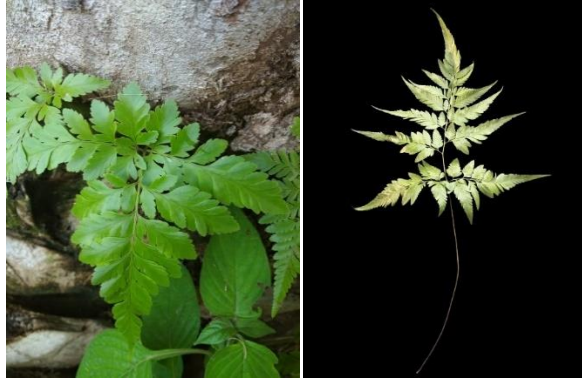
Figure 3. Davallia denticulata Morphology