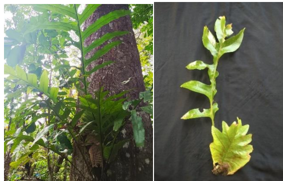
Figure 6. Drynaria sparsisora Morphology

Based on research, this epiphytic fern has roots in the form of a taproot, cylindrical in shape, blackish brown in color. Climbing or creeping stems, narrow like rhizomes, dark brown scaly surface. Leaf stalks are brown, round. The ental form is pinnatifid. The top of the leaf is dark green, while the bottom is light green. The supporting leaves or sterile leaves are short and wide in the middle and thin. The edges of the fertile leaves are split, the tip is pointed, and the base is tapered. The leaves are pinnate. The sporangium is small, orange in color, located between the fertile leaf veins and scattered irregularly. This fern is often found on rocks, in open areas and along river banks and can also be found in tall trees, living as an epiphyte. Drynaria sparsisora Moore leaves contain flavonoids and steroids which function as anti-inflammatory, anticancer, antimicrobial, antifungal and antiviral. Meanwhile, the rhizomes contain terpenoid compounds which function as antioxidants, anticancer, antimicrobial and neuroprotective (Purnawati et al. , 2014; Karim et al. , 2022; Majid et al. , 2022).