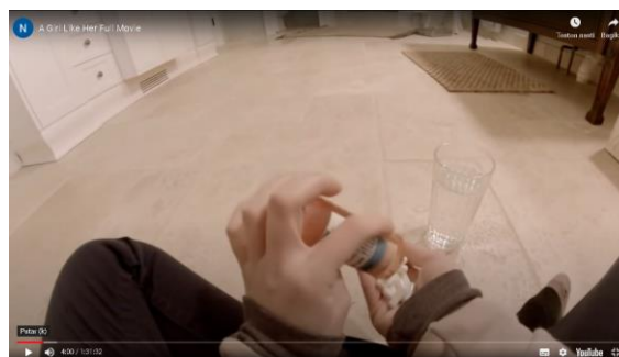
Figure 10. She takes the medicine

The most serious effect is she tried to kill herself by drinking over dose medicines