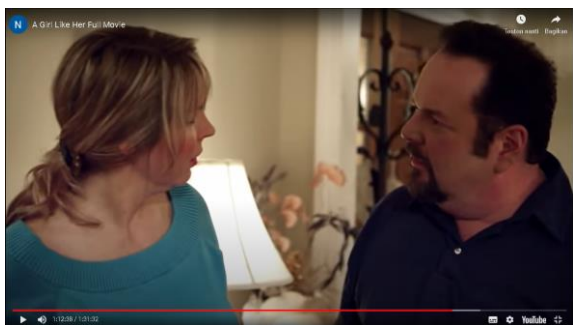
Figure 8 Every's parents argues to give permission to Every