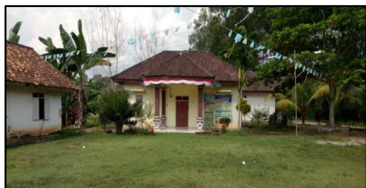
Figures 2 Village Chief's Office

Purwosari Village was formerly known as Purwowiroto Village, because there was no inauguration over time an idea emerged from the community to change Purwowiroto Village to Purwosari Village and was inaugurated in 1969. Which means, Purwo means "kawitan/prefix" and Sari means "Core". According to information from the website (Sarana Prasarana – Porwosari, n.d.) Purwosari Village is included in the category of underdeveloped villages, but this village has the potential to become a developed village because of a tourist attraction that used to die once due to the construction of a dam and in 2018. The dam or it was transformed by the community into a tourist attraction that is widely known in the community as Embung Puri Idaman and is now the icon of the village. When viewed from the readiness of Purwosari village which is an administrative area in supporting the tourism needs of Embung Puri Idaman can be seen from the following picture: