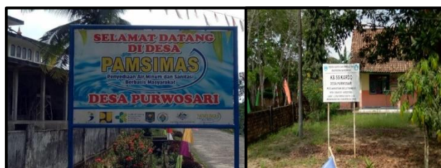
Figure 4. The Feasibility of Support the Health

In Purwosar village, there is also a PKK Mobilization Team