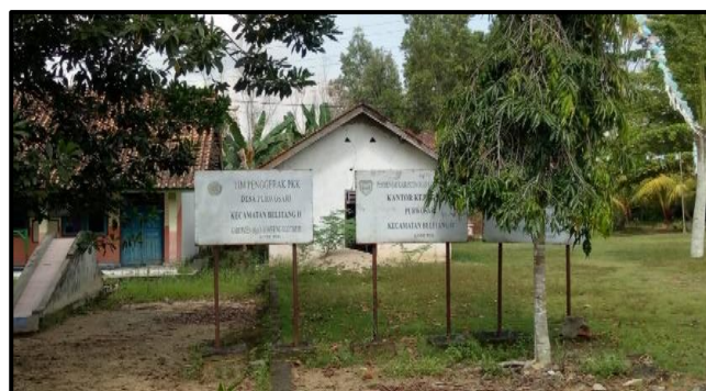
Figure 3. Location of PKK Team Secretariat

The village office that has been established with this permanent building is very feasible to do Meetings for tourists.