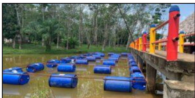
Figure 6. Fish Cage

This opportunity in the SWOT theory is applied through the strategy carried out by the manager of the Embung puri idaman tourism village is to make the seminal event of the Embung puri idaman tourism village as a medium for preserving the deforested natural environment, not only that the inauguration of the Embung puri Idaman tourism village as a medium for fostering community empowerment so that the results of community creativity can be marketed in the tourism area of Embung puri idaman tourism village. In addition, maintenance of animal habitats in the Embung Puri Idaman Area is carried out by scattering seeds of gold and catfish in cages that have been provided